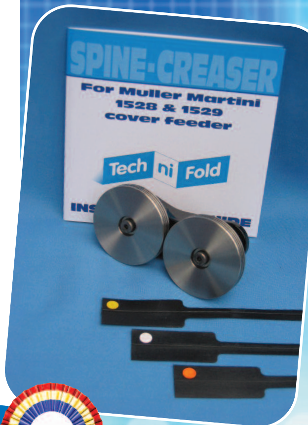
Spine-Creaser to fit Muller Martini Saddle Stitcher