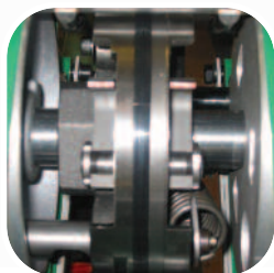
Creasing matrix applied