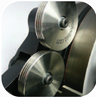
■ Simple installation

Never again tie up your cylinder with straight line creasing jobs destined for the cover feeder. And never again send a cover out to another shop for creasing. Simply cut your covers and load them in the cover feeder!